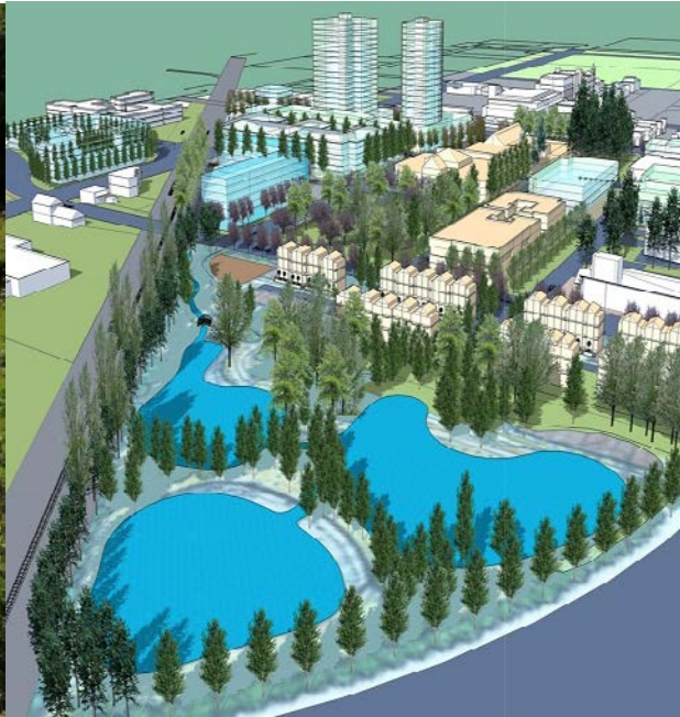
A city centre environment

Using one of the images above suggest one interesting geographical enquiry question. Outline four different pieces of field information (fieldwork data) that might be recorded and describe the fieldwork skills most likely to be used to collect the data. [10]