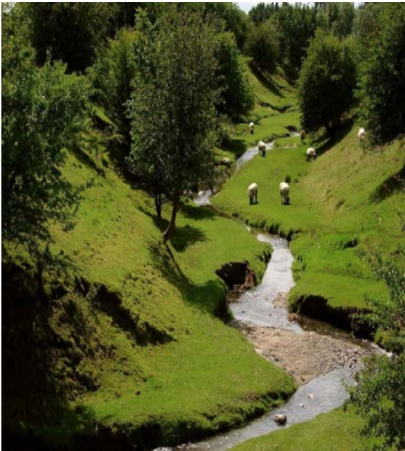
A river environment