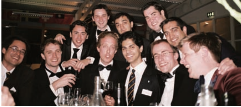
Above: Class of 1999 10th reunion.