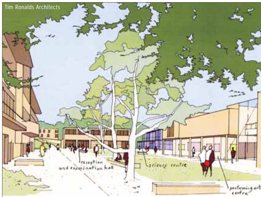
Vision for the Flat

For more information please contact the Development Director at Sevenoaks School.