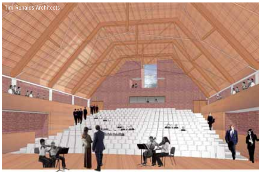
Concert Hall seen from the stage